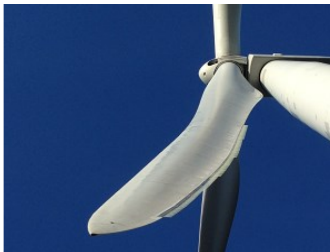
Fig 1: LNTes at the wind turbine rotor blade

In order to optimize noise emissions, the rotor blades are equipped with Low-Noise-Trailing-Edges (LNTes) at the pressure side of the blade’s rear edge. LNTes are thin jagged plastic strips. The rotor blades of the Cypress -158 are equipped with these strips at the factory.